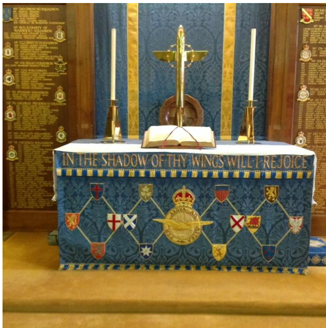
R.A.F. Chapel in Biggin Hill, Kent, England