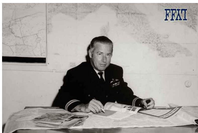
Post war RCAF Officer