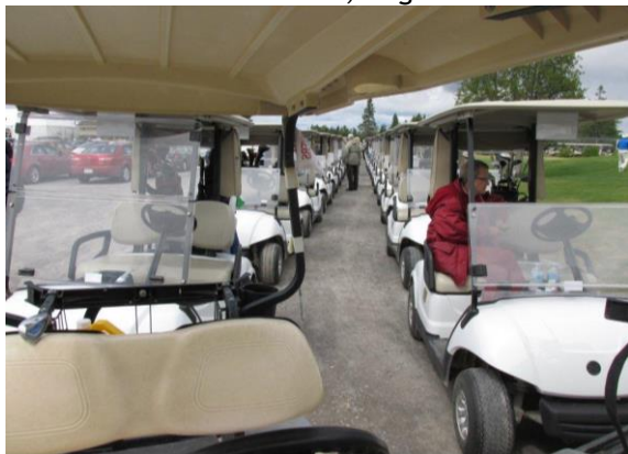
Lined up ready to start the 11th Annual Ray Ponto Golf Tournament